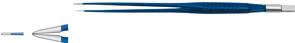
Bipolar forceps Classic, straight, tip 1 mm, blunt, length 225 mm