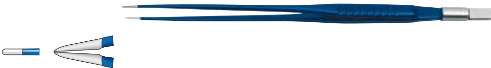
Bipolar forceps Classic, straight, tip 2 mm, blunt, length 225 mm