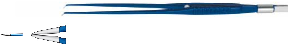
Bipolar forceps Classic, short angled, tip 0.7 mm, fine, length 225 mm