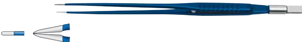
Bipolar forceps Classic, straight, tip 2 mm, blunt, length 260 mm