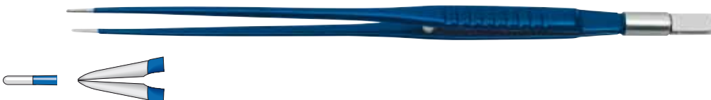
Bipolar forceps Classic, straight, tip 2 mm, blunt, length 300 mm